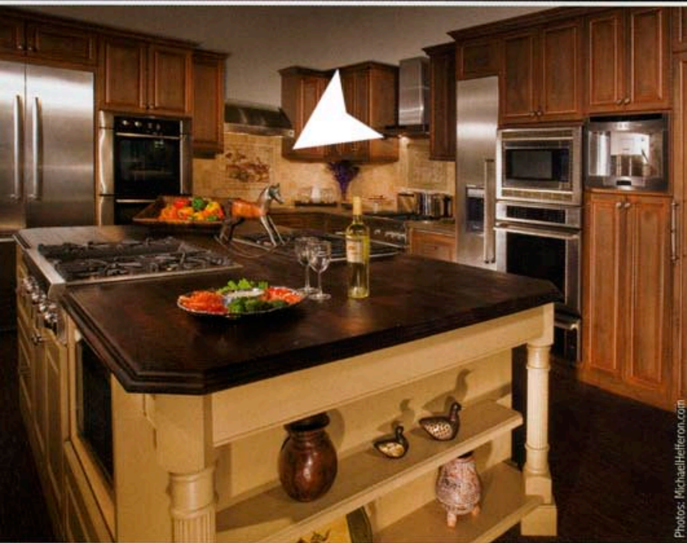
Top: Liebherr refrigeration with Blue Star ceramic range, matching Vent-a-hood and Cuisines Laurier bamboo cabinetry.